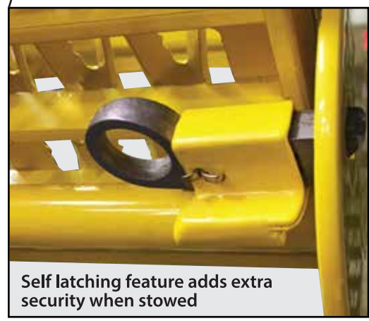
Self latching feature adds extra security when stowed