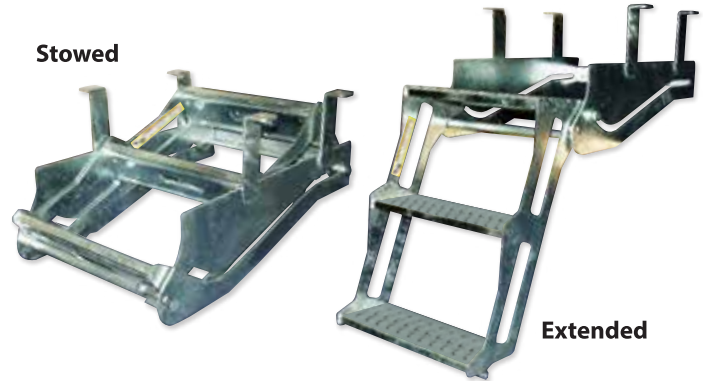
Available in Yellow Powder Coated and Galvanized